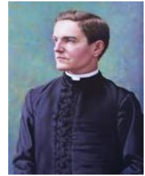
Fr. Michael McGivney